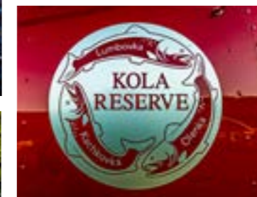
LEFT The smart new livery of the Kola Reserve.