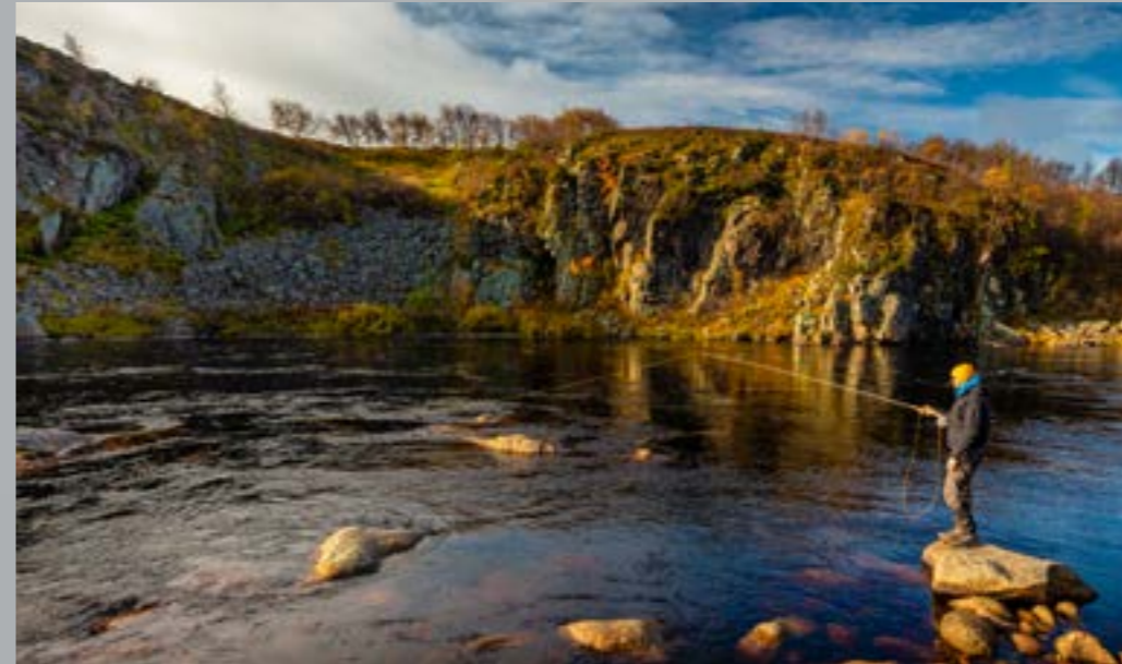
LEFT The Lumbovka's beautiful Horseshoe Pool.

“We enjoyed some great all-night parties, looking up at the Arctic skies and hoping ... for the aurora”